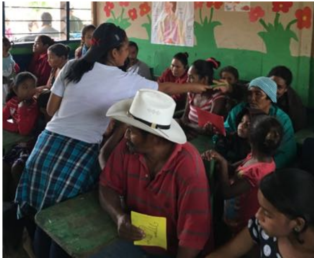
Fuerza Students Administer Educational Pamphlets

The Fuerza students travelled together to the surrounding villages of Carrizalito and El Chaguite. Upon arrival, they used props like backpacks and jackets to demonstrate how to safely use protective equipment when spraying chemicals. The students also administered their educational pamphlets and posters to the village members such that the village members could remember these practices in the future. The audience was very engaged during these presentations and listened intently to the skits, and the Fuerza students were proud of delivering their effective and educational performances outside of El Rosario.