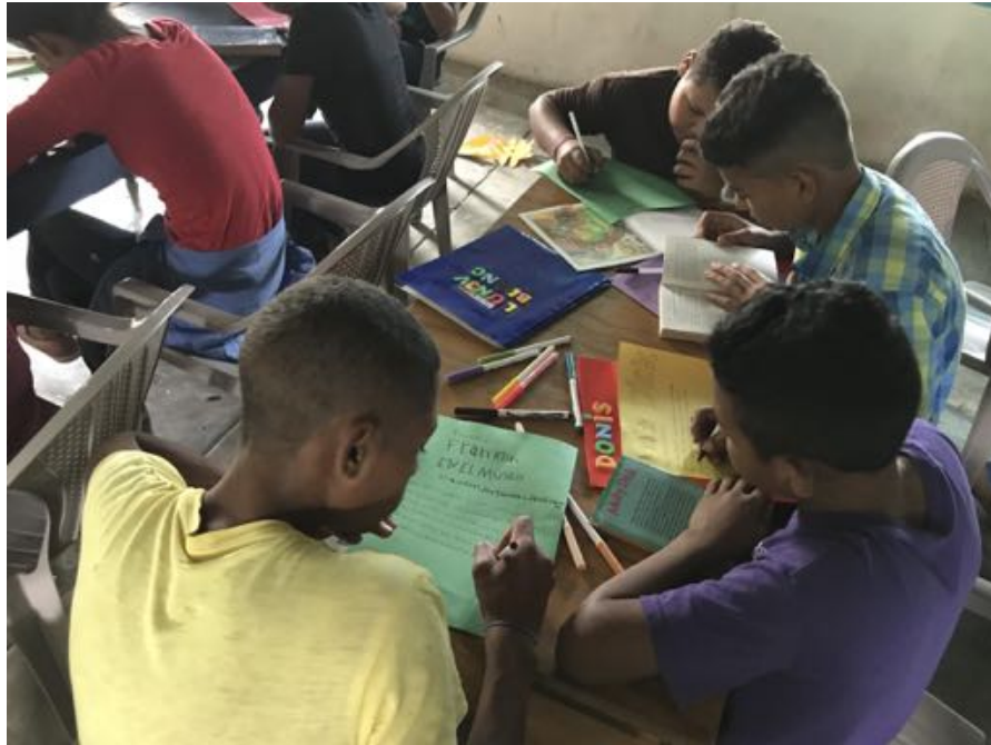
Fuerza Students Create their Book Reports

students taught how to get relevant information about a book by reading the front and back covers and the table of contents. Each student chose a book out of the library and wrote a small report on the book using the information they read.