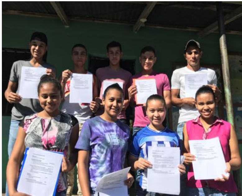
Fuerza Arriba Students with Resumes

As the veteran Fuerza Arriba students prepare to graduate from their high schools, they look towards possible career paths and higher level education. To help these students along their future paths and aspirations, the Dartmouth undergraduates conducted workshops separately with Fuerza Arriba