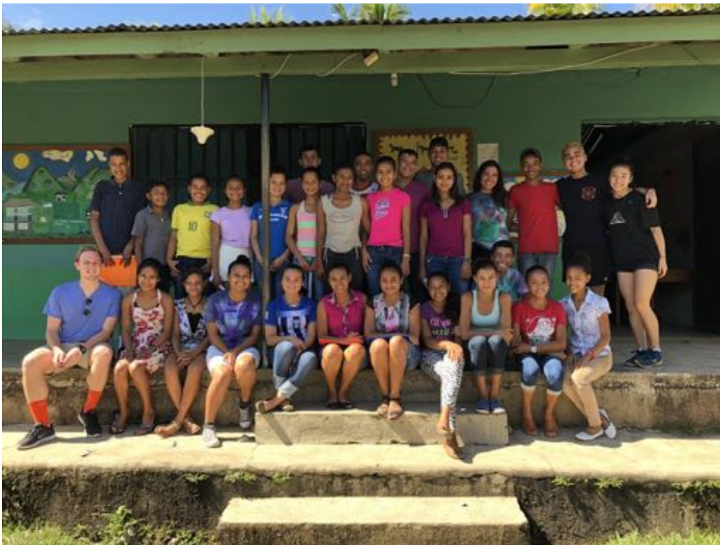
Fuerza Program Participants Outside Educational Center

A team of Dartmouth students and alumna embarked on a familiar journey to Honduras in November of 2017. In the village of El Rosario, they administered the “La Fuerza para el Futuro,” or “Fuerza” program, which develops leadership skills in the youth to catalyze positive change in their communities. In the past, these programs have run concurrently with different public health initiatives in collaboration with the Norris Cotton Cancer Center. During the past March trip, the Dartmouth team created a curriculum that involved educating the community of El Rosario about safely using agricultural chemicals. For the November trip, the team expounded upon this curriculum and travelled to the neighboring communities of El Chaguite and Carrizalito to reach further populations and have a broader impact within the region. Since the team traditionally travels in March, the Dartmouth team was especially excited to experience El Rosario during a new season.