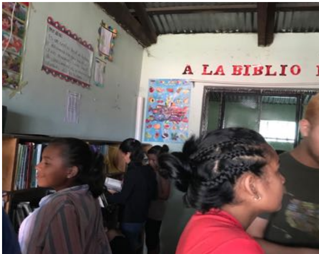
Students Peruse Books in Library

The Fuerza students travelled together to the surrounding villages of Carrizalito and El Chaguite. Upon arrival, they used props like backpacks and jackets to demonstrate how to safely use protective equipment when spraying chemicals. The students also administered their educational pamphlets and posters to the village members such that the village members could remember these practices in the future. The audience was very engaged during these presentations and listened intently to the skits, and the Fuerza students were proud of delivering their effective and educational performances outside of El Rosario.