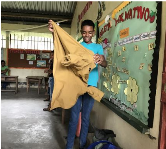
Fuerza Students Perform Skits in Carrizalito

The Dartmouth students were especially proud to see how much the Fuerza Arriba veteran students had grown as a result of their continued participation in the program. Because of their commitment to the program over the past years, they have demonstrated incredible leadership skills. With little guidance, the Dartmouth students watched as the veteran students confidently stood at the front of the classroom to educate their peers on how to effectively deliver the skits with the proper information.