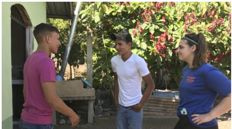
Fuerza Arriba Students Practice Interview Skills

The Dartmouth students also conducted mock interview workshops with the Fuerza Arriba students. They practiced how to maintain eye contact with a future employer and how to effectively their strengths and fit for a job position. As the Fuerza Program has seen the growth of many students, we look forward to seeing how these future leaders will utilize their developed skills in their future careers.