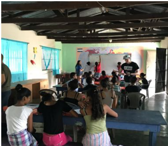
Fuerza Students Prepare for Skits

The agricultural sector is a critical component of the economy of Honduras. Unfortunately, farmers who work in rural villages like El Rosario work with agricultural chemicals without wearing the proper protective equipment to reduce respiratory and tactile exposure to these harmful chemicals. Members of the family can also be exposed to the chemicals because they are stored at home. To exacerbate the issue, men do not shower before returning home which results in contaminated clothing within their homes.